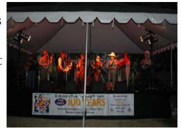
The Fiddlin Foresters and Black Irish Bands closed out a great day!

3FIA joined the Stanislaus National Forest employees and a number of local individuals and community groups in hosting an event at the Sonora Fairgrounds on October 15, 2005 to celebrate the 100 years of the Forest Service. Tabbed the “Event of the Century” it certainly turned out to be just that. The day long festival included live theater, living histories, films, over 100 indoor exhibits, lots of outdoors activities and displays, music, food, and much more. The weather turned perfect and the crowd was estimated to be between 3 and 4 thousand.