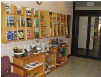
Tule/Hot Springs District Office, Springville and Sierra Supervisors Office, Clavis