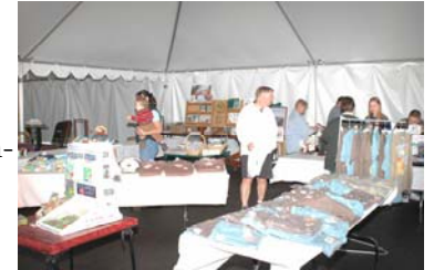
3FIA Market Place at Sonora Centennial event.

A bat can eat as many as 1,000 insects an hour.